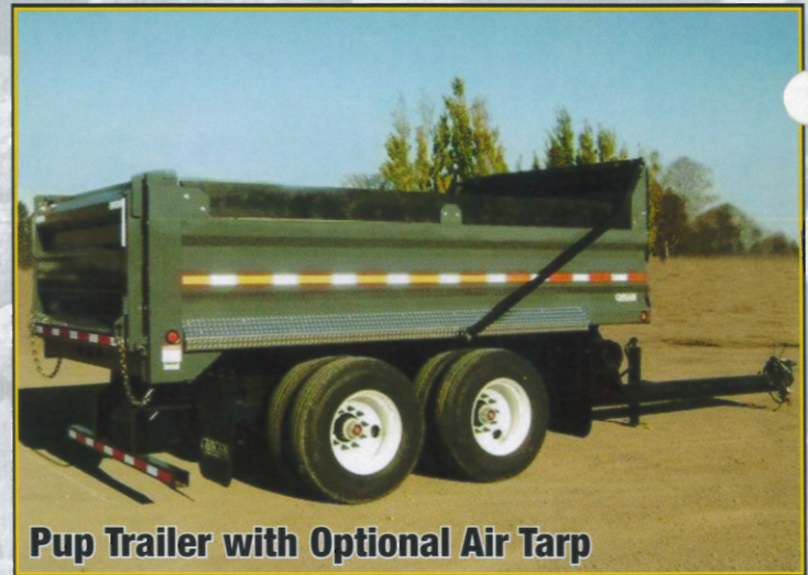
Pup Trailer with Optional Air Tarp