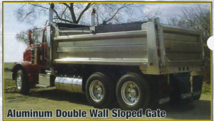
Aluminum Double Wall Sloped Gate