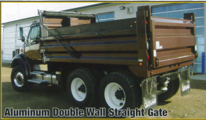
Aluminum Double Wall Straight Gate