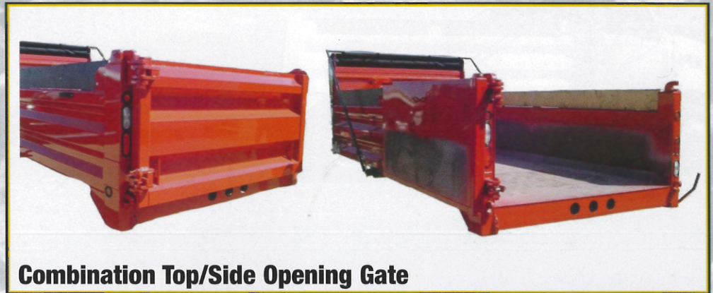
Combination Top/Side Opening Gate