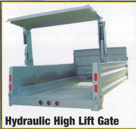
Hydraulic High Lift Gate